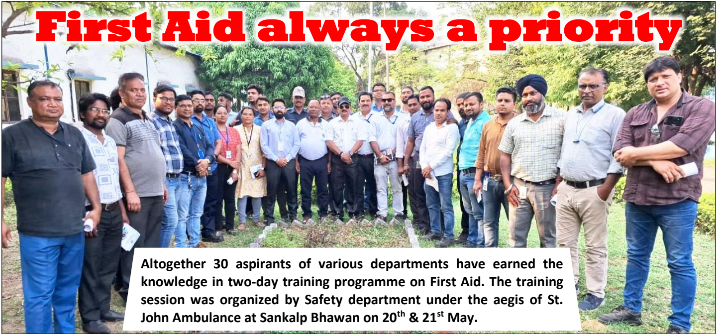
Altogether 30 aspirants of various departments have earned the knowledge in two-day training programme on First Aid. The training session was organized by Safety department under the aegis of St. John Ambulance at Sankalp Bhawan on 20 th & 21 st May.